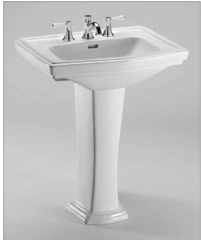
Faucet sold separately