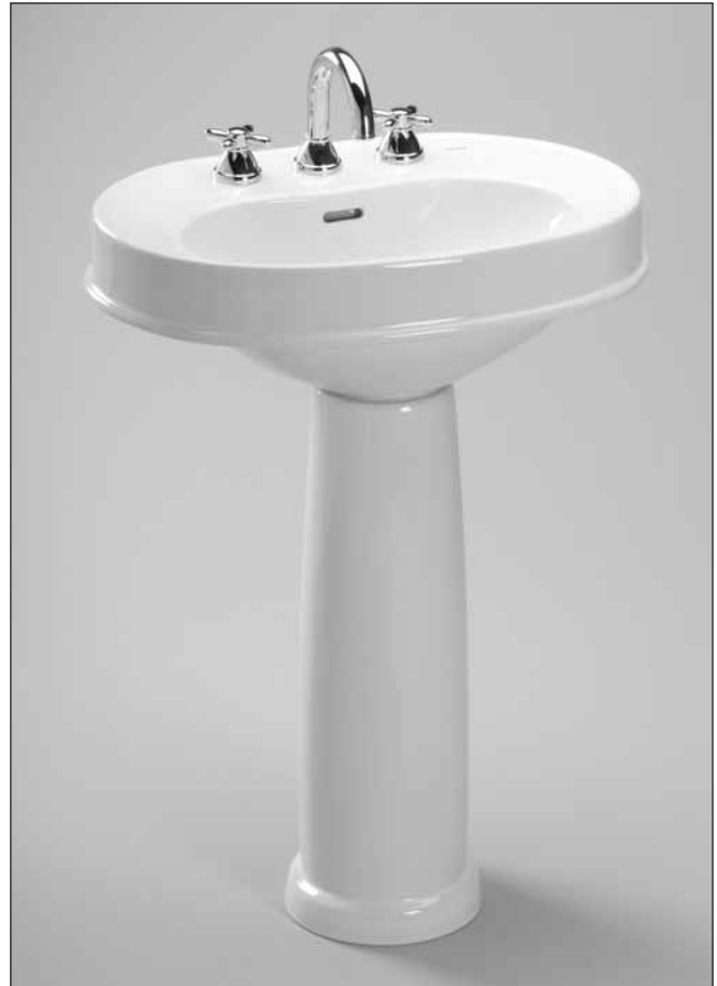
Faucet sold separately